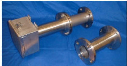
2. Purged, stainless steel cross duct system