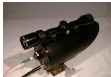
3. Transmitter head for long path work