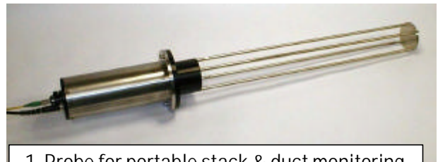
1. Probe for portable stack & duct monitoring